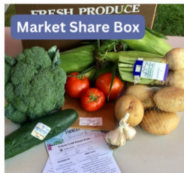
Market Share Box

OUR "VEGETABLE SIDES" BOX HAS ENOUGH FOOD FOR 2 SERVINGS FOR 3 MEALS (OR 6 MEALS AT A SINGLE SERVING). THIS IS A NUTRITION-PACKED BOX AT AN AFFORDABLE PRICE POINT.