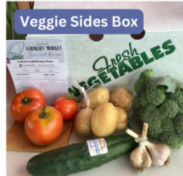
Veggie Sides Box

If you want to pay with SNAP or have questions, call or text Allison Rian at 218-831-8890