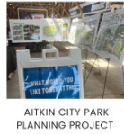
AITKIN CITY PARK PLANNING PROJECT