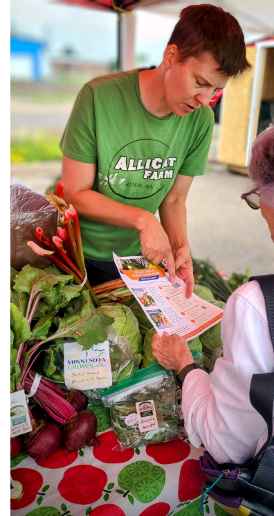
Aitkin Farmers Market Hub Manager

If you'd like to learn more about the Aitkin Farmers Market Hub, please contact Allison to learn more!