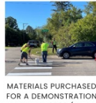
MATERIALS PURCHASED FOR A DEMONSTRATION PROJECT IN 2023 (AITKIN)